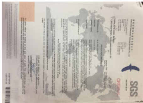
product confirmity- Benxi betai.JPG 2266K