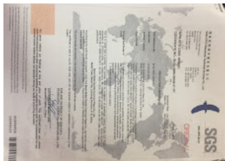
product conformity- Benxi betai.JPG 2266K